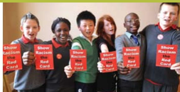
Pupils from Donabate Educate Together School, and St Josephs CBS Drogheda at the launch in Malahide

The DVD is accompanied by a 28 page pack and additional downloads to support activities in the education pack. While the education pack is relevant to subjects such as history, geography and religion, it is particularly applicable to CSPE and Transition Year curricula as it provides for active learning and project based work. There are six sections in the pack. They are: 1. What is racism? 2. Action against racism (schools) 3. Action against racism (sports) 4.