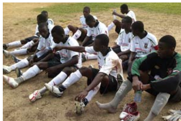
U16 Glentoran team in Ghana resting at half time

SARI does not receive any core funding from the Irish State, but relies primarily on private donations and public collection points. Love of sport and a strong desire to destroy The